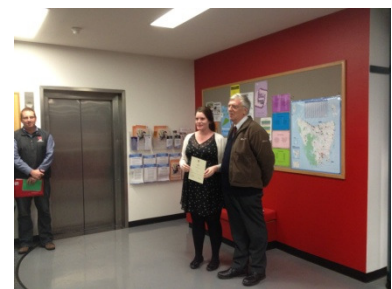
Biomedical Science Awards Recipients.