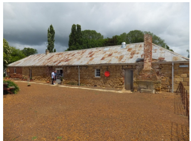
AIMS Travelling Oration 2011.